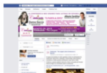
ENGLISH/SPANISH SOCIAL MEDIA