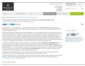
ENGLISH ONLINE PR NEWswire