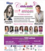
SPANISH-ADS PRINT EL LATINO NEWSPAPER