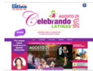
SPANISH ONLINE CELEBRANDOLATINAS.COM