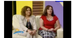
SPANISH TV – TELEvisa BUENOS DÍAS