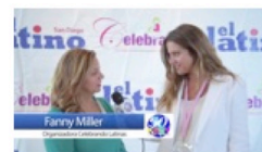
SPANISH TV KSDY 50