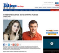
SPANISH ONLINE ELLATINOONLINE.COM