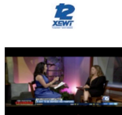
ENGLISH TV CHANNEL 6 – THE CW NETWORK