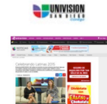
SPANISH TV UNIVISION-CANAL 33