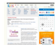
ENGLISH ONLINE KPBS