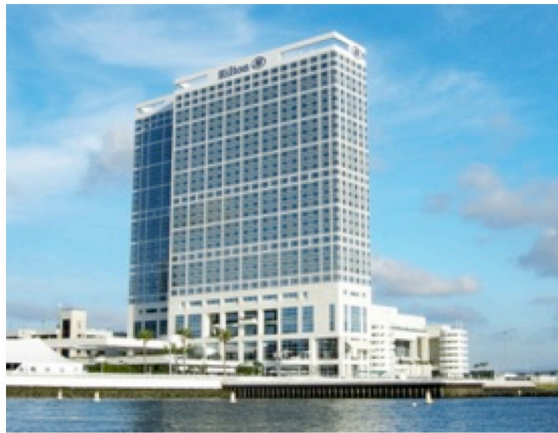
Hotel Hilton San Diego Bayfront