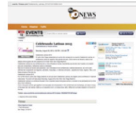
ENGLISH ONLINE ABC 10 NEWS