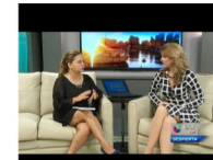
SPANISH TV – ENTRAVISION DESPIERTA SAN DIEGO